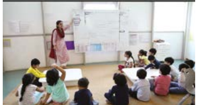
Learning to Learn, India, Interdisciplinary learning